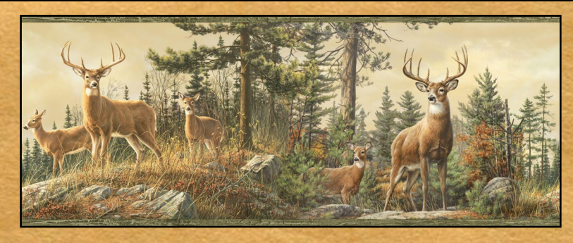
Official Archery Deer Hunting Regulations

1. Members, their spouses, their children and their grandchildren under the age of 21 are all eligible to hunt at the NDA farm. Those under 21 must have the card carrying member with them at all times while hunting.